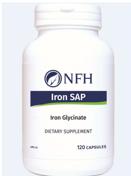
Recalled Iron SAP Iron Glycinate (120 capsules 1167U)