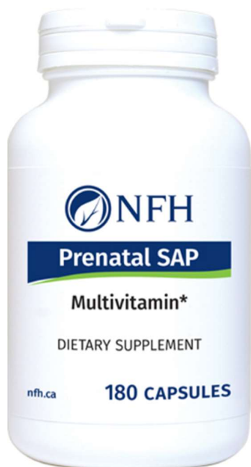
Recalled Prenatal SAP Multivitamin (180 capsules 1034U)