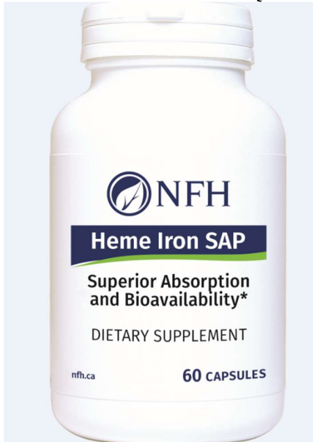
Recalled Heme Iron SAP Superior Absorption and bioavailably (60 capsules 1124U)