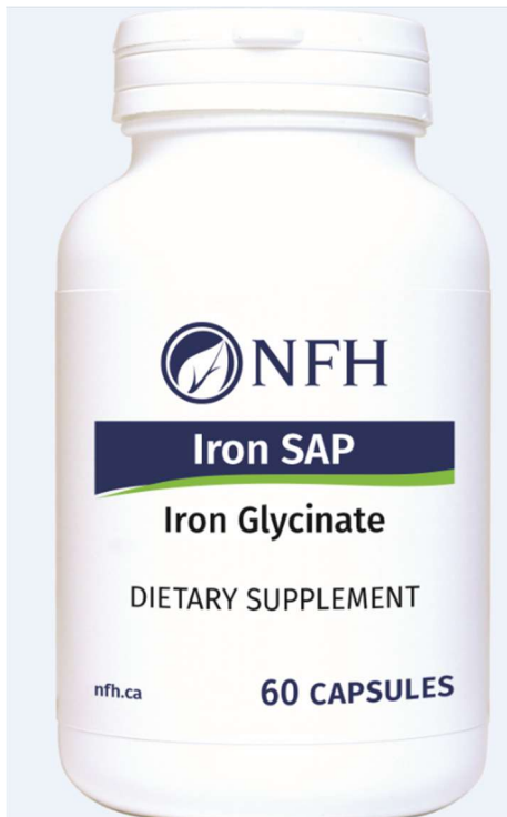
Recalled Iron SAP Iron Glycinate (60 Capsules 1029U)